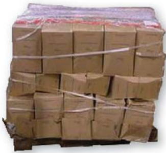
Hand stacked load

There are several reasons for choosing to palletize your packaging line automatically. First, palletizers stack a better quality load. Product damage caused by irregular loads is now part of the payback analysis to justify a palletizer. Secondly, palletized loads help save space as they are able to be stacked for onsite storage or shipping requirements.