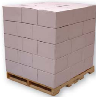
Machine palletized loads